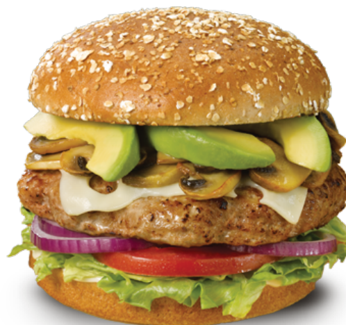
TURKEY AVOCADO SWISS BURGER

Balsamic onions, sautéed mushrooms & feta olive spread. Phi Beta Yum.