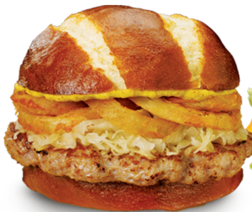
WINDY CITY BRAT BURGER